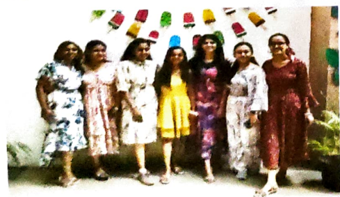
HAWA HAWAI THEME DAY