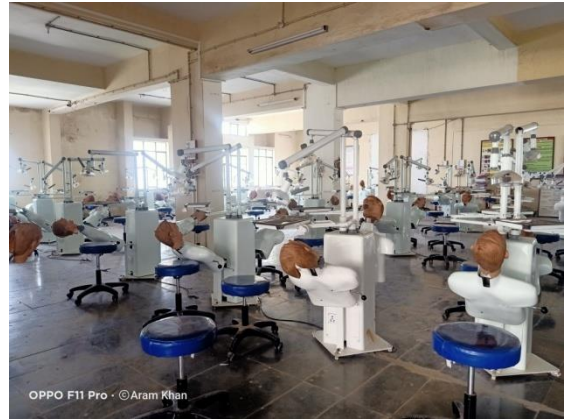
Conservative Dentistry Pre-clinical lab