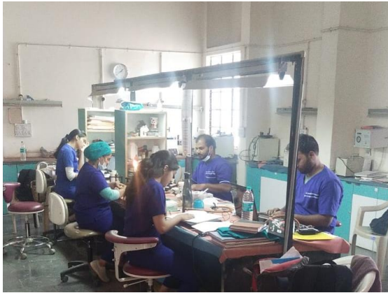
Prosthodontics clinical lab