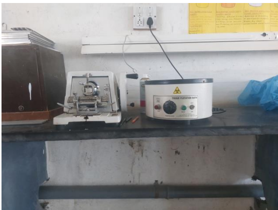
Tissue processing lab