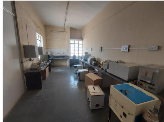
Conservative clinical lab