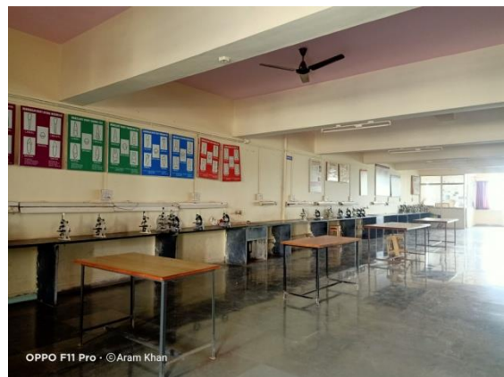
Oral Pathology lab