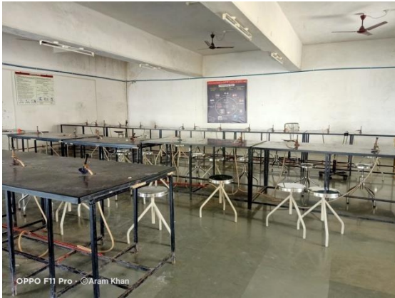
Prosthodontics Pre-clinical lab