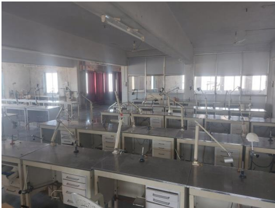
Dental material lab