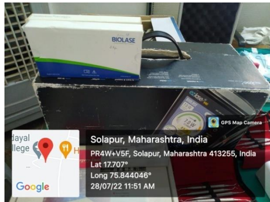
LASER KIT AND ITS LIP