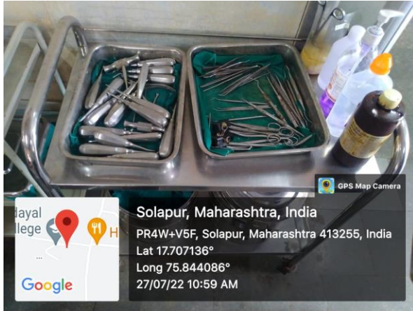
ELEVATORS, MOUTH MIRROR, PROBE TWISTER, PERIOSTED ELEVATOR