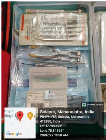
LASER,RVG CONNECTOR,GUIDE KIT(IMPLANT),COMPOSITE KIT