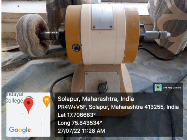
DENTURE POLISHING LATHE