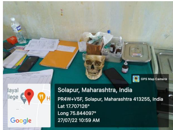
LA BOTTELS SURGICAL SKULL MODEL