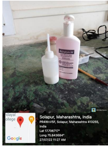
Seprating media monomer polyme