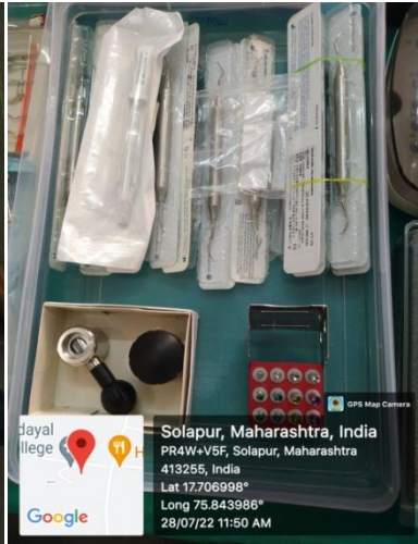
SET OF SCALERS