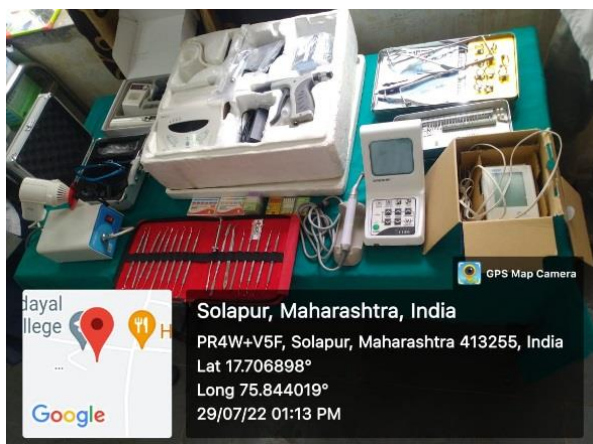
INSTRUMENTS & EQUIPMENTS