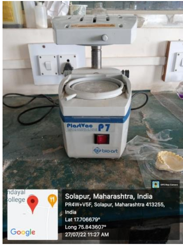
Rssix vacuum forming machine